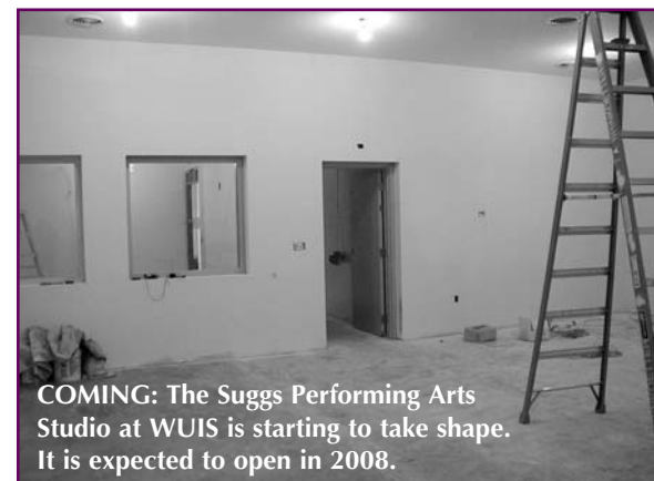
COMING: The Suggs Performing Arts Studio at WUIS is starting to take shape. It is expected to open in 2008.

Special thanks go to our partners in this project: the Mayor's Office of Education Liaison, Springfield Rotary Club Sunrise and Springfield School District 186.